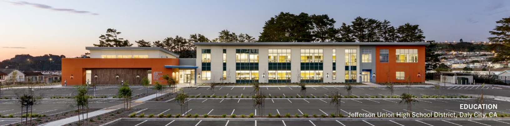
EDUCATION Jefferson Union High School District, Daly City, CA