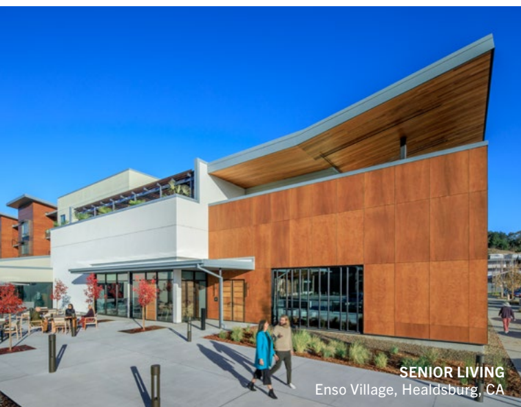
SENIOR LIVING Enso Village, Healdsburg, CA